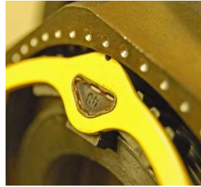
Starting center tab