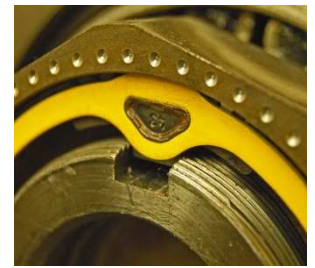
EasyView Tab Engaged