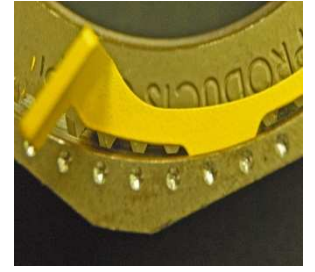
EasyView Tab Engaged