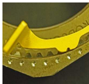
EasyView Tab NOT Engaged